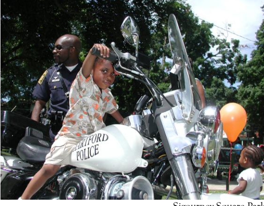
Sigourney Square Park

The PUBLIC SAFETY Committee works to improve relations between the police and fire depts. and the community, and to increase their effectiveness in Asylum Hill in order to establish a safer neighborhood for all its residents and visitors.