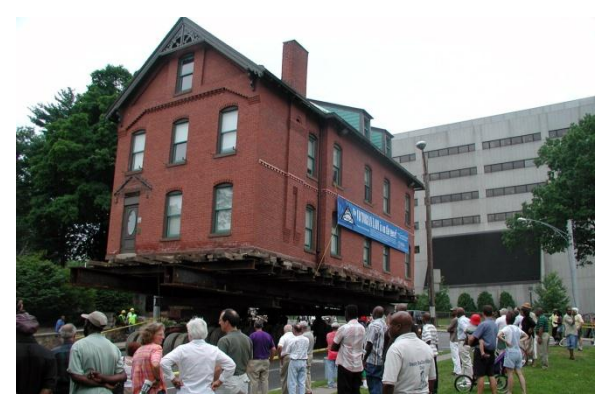
Victorian Home moved to 21 Ashley St

Committee works to improve all modes of transportation and to expand business and employment opportunities for Asylum Hill residents.