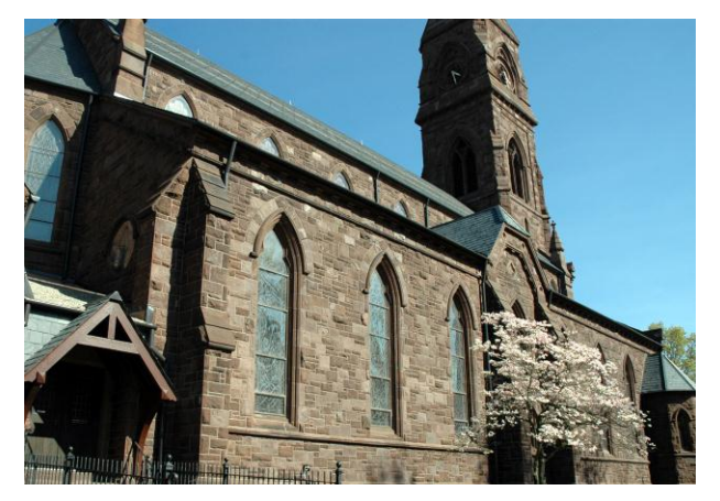
Asylum Hill Congregational Church